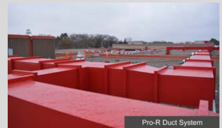
Pro-R Duct System

They also put more pressure on the building's HVAC system and increase energy costs.